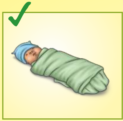
To keep the newborn warm, cover his/her head and body all the time