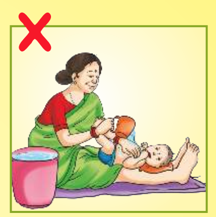
Do not bathe immediately after birth. Do as advised by the doctor

A baby weighing less than 2.5 kg at birth is considered as low birth weight baby.