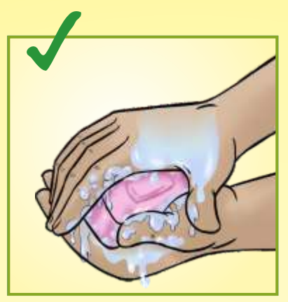
Wash hands before touching the newborn, before breastfeeding and after cleaning his/her feces