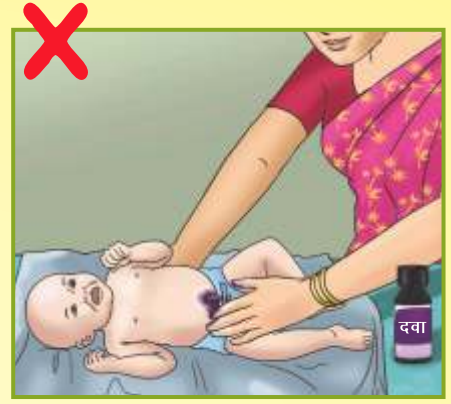
on the cord stump to avoid infection